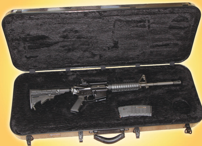
DM1000™ Carbon Fiber Silhouette™ M4 Rifle Case